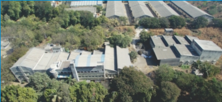
Arial View Of Khambete Kothari Cans & Allied Products. Pvt. Ltd.

KK MILKCANS - Name synonyms with internationally accepted high quality milkcans & pioneer producer of single joint steel and one piece monoblock design cans which enhanced concept of clean milk procurement. The continuous research & development has been awarded with growing demand in more than 40 countries across the globe. For more than 40 years, KK Cans have understood the requirements of milk producers and has consistently given them better products that have met not only the present needs but future requirements also. KK cans due to its inherent qualities of hygienic design, easy & faster cleanability and extra strength, it is small wonder that milk producers of far east Asia, Middle East, Africa, Europe and South America trust KK cans in their efforts to produce clean milk for healthy life.