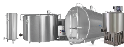
Cooling Tanks & Heat Recovery Units