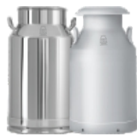
SS & Aluminium Milkcan