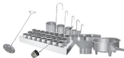
Milk Collection Accessories