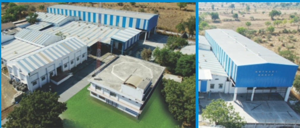
Arial View Of Associated Dairyfab Pvt. Ltd.

ADFL is one of the largest manufacturer of milk cooling solutions. We truly understand Indian dairy farmers and have two decades of experience. Due to high quality of our products today we are leading supplier to International market. We are devoted for development of dairy industry through continuous research and enriching livelihood of dairy farmers by offering quality products at reasonable price.